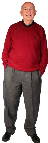
Can extra zinc help him to live longer?